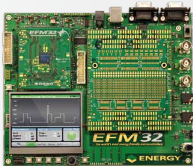
EFM32 Gecko Development Kit with MCU plug-in and prototype boards and Advanced Energy Monitoring